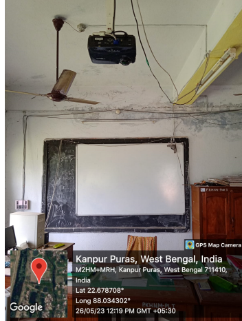
Kanpur Puras, West Bengal, India M2HM+MRH, Kanpur Puras, West Bengal 711410, India Lat 22.678708° Long 88.034302° 26/05/23 12:19 PM GMT +05:30