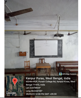
Kanpur Puras, West Bengal, India M2HM+R09, Purash College Rd, Kanpur Puras, West Bengal 711410, India Lat 22.679844° Long 88.034735° 26/05/23 12:08 PM GMT +05:30