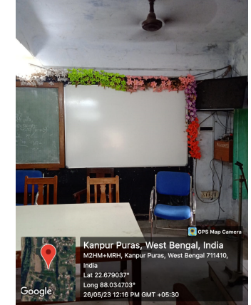
Kanpur Puras, West Bengal, India M2HM+MRH, Kanpur Puras, West Bengal 711410, India Lat 22.679037° Long 88.034703° 26/05/23 12:16 PM GMT +05:30